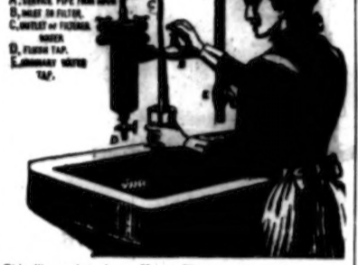
This illustration shows House Filter (pattern B) fitted to service pipe over sink. Output, so to 25 gallons per hour, according to pressure.

Berkefeld Filters, are made in a variety of patterns, as Pressure, Pump and Drip Filters.